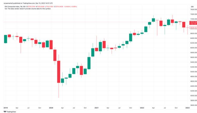
Figure 1. IHSG Chart 2019-2022